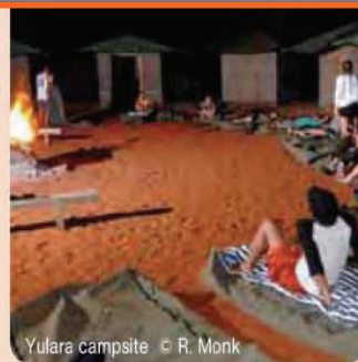
Yulara campsite