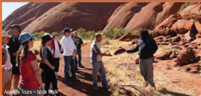
Anangu Tours - Mala Walk